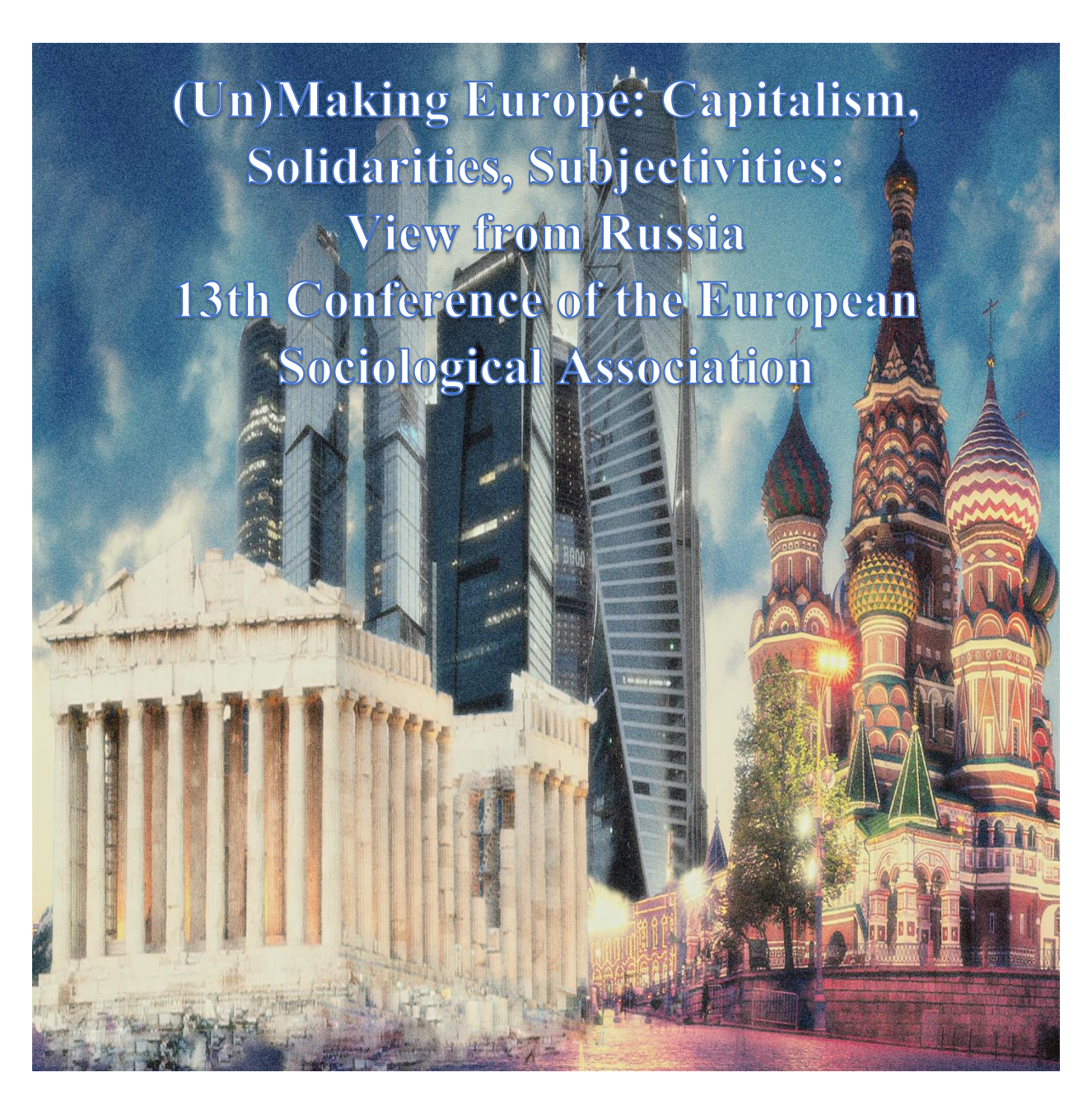
Athens, Greece, 29 August to 1 September 2017